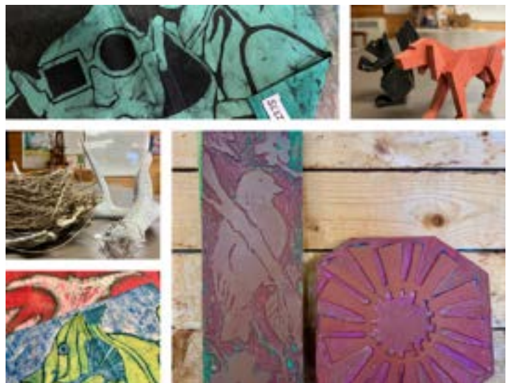
A few of the natural and museum artifacts our instructors may bring to your classroom.

Students will also have the opportunity to think about what a museum is by investigating a selection of creations made by Barbara and AC Leighton. Students will have the chance to handle these objects, ask questions, and draw inspiration for their own art project!